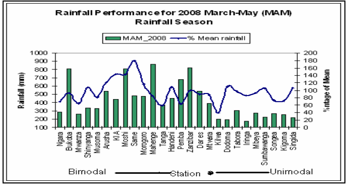
Figure 1: Seasonal rainfall and its percentage against long-term mean

Most parts of the country received normal to below normal rainfall during March to May 2008 rainfall season with the exception of northern coast, northeastern and south-western highlands which recorded above normal rainfall. March to May ( Masika ) rains are more significant over bimodal rainfall pattern areas (Lake Victoria basin, northern Kigoma, northeastern highlands, northern coast and islands of Zanzibar and Pemba) as a result more rainfall amounts were reported in those areas than over unimodal rainfall pattern where the season ends normally in April (Figure 1).